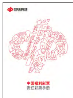
中国福利彩票责任彩票手册 China Welfare Lottery Responsible Gaming Manual

中福彩中心秉承“福彩与责任共生”的发展理念，将责任融入业务运营的每个环节，持续加强责任彩票体系化建设，建立科学系统的责任彩票框架体系，明确责任彩票原则，为各省福彩中心提供责任彩票建设指导，全面推进责任彩票建设工作。2020年，编制并印发《中国福利彩票责任彩票手册》，提升福彩队伍对责任彩票的认识和理解，为将责任理念融入业务运营奠定坚实的基础。