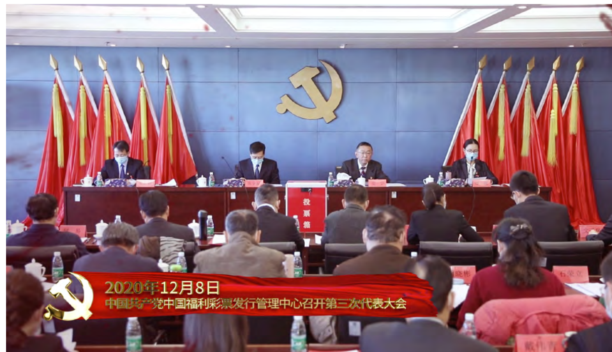
中福彩中心召开第三次代表大会 CWLIMC held the Third Communist Party Congress

CWLIMC continues to strengthen comprehensive leadership of the party, finishes the leadership transition of its party committee, steadily advances the responsibility system of administrative leaders under the guidance of party committee, gives better play to the party committee's roles of grasping the direction, controlling the overall situation and guaranteeing the implementation, promotes CWL to have a foothold in new development stages, turn new development ideas into reality and build a new development pattern. CWLIMC further accumulates the "Four Strengths" of party branches, adjusts and optimizes party branch settings, builds strong party branches, and further standardizes organizational life and the construction of party teams, thus driving forward the backward with the activists, promoting the activists to march forward farther, promoting the progress of grassroots party organizations in all aspects, giving full play to the fortress role of party branches and the exemplary roles of party members, thus vigorously promoting the integration of business and party construction work.