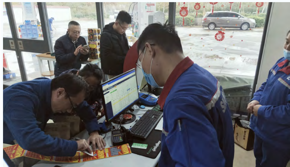
在中国石化易捷便利店销售福彩即开票 Instant lotteries are on sale at Sinopec Yijie convenience store

In April 2020, Shandong Welfare Lottery and sales channels of Sinopec reached a strategic co-operation intention, that is, provincial branches should issue a consignment license for Sinopec's gas station Yijie convenience store that sells lottery. Dingding system was used to carry out lottery training for front-line personnel at gas stations, with more than 2,000 online trainees. As of December 2020, 600 gas stations in 16 prefectures and cities across the province have launched instant lottery sales, with a sales volume of RMB 3.56 million yuan.