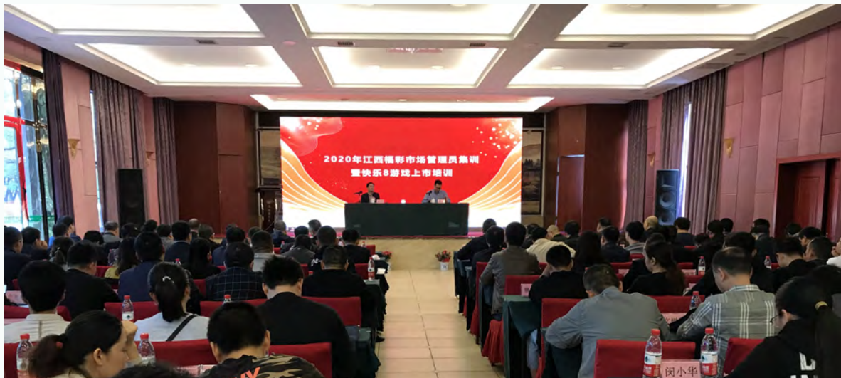
江西省福彩中心开展专管员集训 Jiangxi Welfare Lottery carries out intensive training for managers

◎ Jiangxi Welfare Lottery focused on strengthening and standardizing lottery sales and business ability cultivation and organized intensive training for grassroots managers in each spring and winter to improve their comprehensive quality, strengthen regional market management service, channel development and publicize execution of all work.