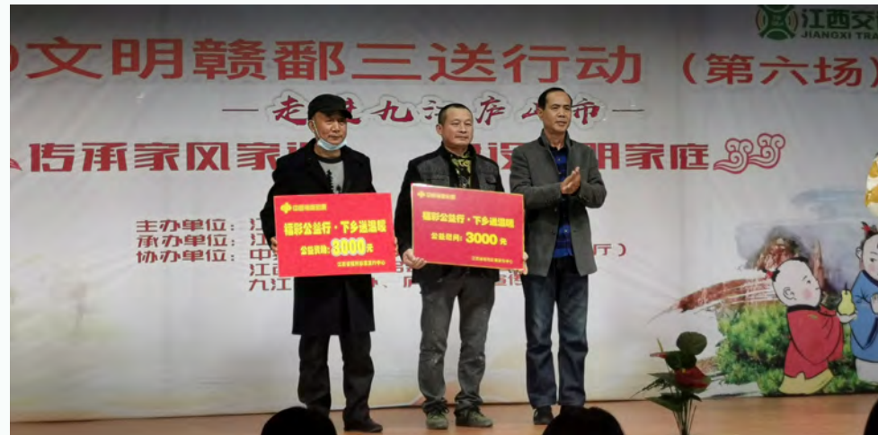
江西省福彩中心组织开展“福彩公益行·下乡送温暖”公益活动 Jiangxi Welfare Lottery organized and conducted the public welfare activity named “Welfare Lottery Public Welfare Trip · Bringing Warmth to Villages”

◎湖南省福彩中心携手湖南省直机关文明办、湖南财信基金会联合开展“微光大义·致敬白衣天使”志愿服务活动，以志愿服务的形式走访慰问湖南省援鄂医护人员及家属，为奋战在抗疫前线的白衣天使们加油鼓劲。