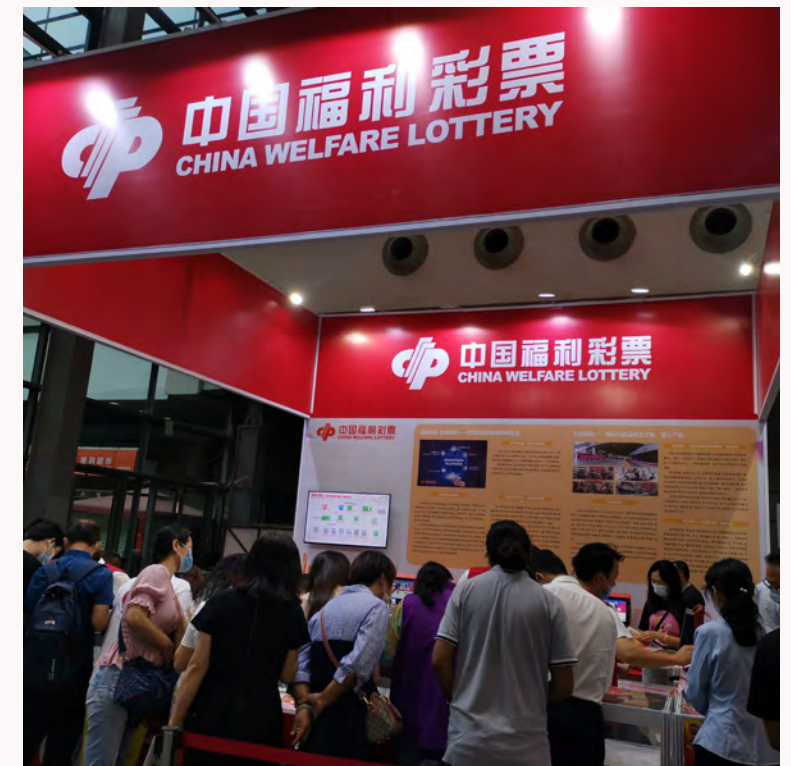
深圳市福彩中心参加第八届慈展会 Shenzhen Welfare Lottery participated in the 8th Charity Exhibition

© In September 2020, Shenzhen Welfare Lottery participated in the 8th China Charity Project Exchange Exhibition (referred to as the "8th Charity Exhibition"), demonstrating the application of blockchain technology in lottery sales at the scene, showing that the combination of lottery and new technologies can help the lottery industry to transform and upgrade its operations.