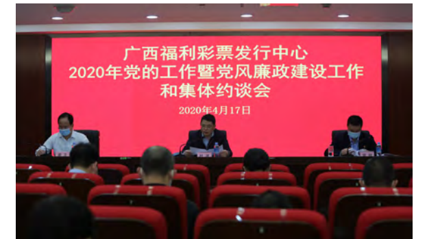
广西省福彩中心召开党的工作暨党风廉政建设工作 和集体约谈会 The work of the gathering of Guangxi Welfare Lottery and the work of Party style and upholding integrity construction and collective talks