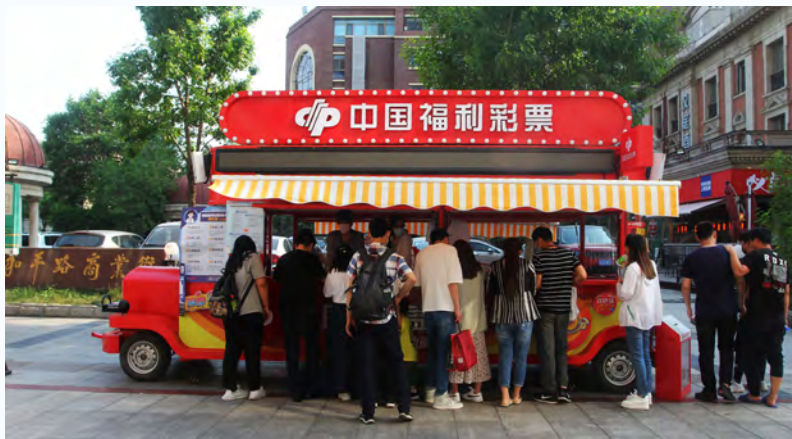
天津市福彩中心设计的购彩车 lottery sales car designed by Tianjin Welfare Lottery

© Tianjin Welfare Center's independent and innovative design of the lottery sales car, through the display of the Welfare Lottery Game Logo and the "welfare lottery, national lottery, public welfare lottery" slogan on the body, people have a more intuitive and full understanding of the Welfare Lottery, expanding the lottery purchasing group, demonstrating the public welfare image of Welfare Lottery, and expanding the brand influence of lucky draw lottery tickets.