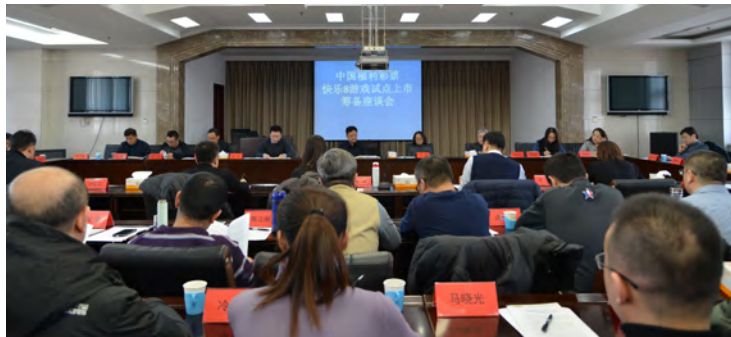
中国福利彩票快乐8上市座谈会 Launching Forum for Happy 8 under CWL

CWLIMC discussed and revised the application materials of Happy 8 in accordance with the requirements of the Ministry of Finance, organized pilot sales and expert consultations, and finally launched Happy 8 in July 2020 with the approval of the Ministry of Finance. Benefiting from sufficient preparations, scientific and rigorous pilot sales, assessment of marketing effects and operational risks, summarization of pilot experience and other advanced practices, Happy 8 achieved fruitful results after being launched. As of December 2020, Happy 8 was sold in more than 30,000 retailing outlets in 17 provinces, with cumulative sales of RMB 826 million yuan.