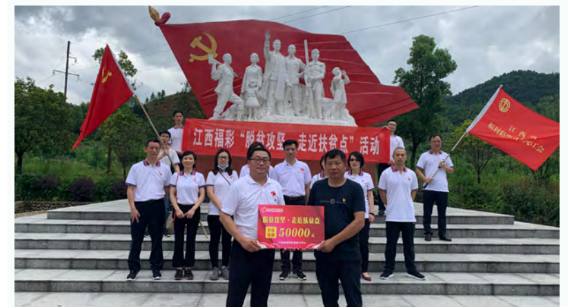
江西省福彩中心开展“走近扶贫点·助力脱贫攻坚”主题党日活动 Jiangxi Welfare Lottery conducts the party day activity themed on “Approaching Poverty Alleviation Places · Helping Poverty Alleviation”

◎ In June 2020, Jiangxi Welfare Lottery conducted the party day activity themed on “Approaching Poverty Alleviation Places · Helping Poverty Alleviation”, combining the work of party building with poverty alleviation. It offered the welfare public welfare fund of RMB 50,000 yuan for purchasing medical rehabilitation devices like wheelchairs, massage couches and blood pressure testers which were donated to village clinics and some old patients to contribute to poverty alleviation.