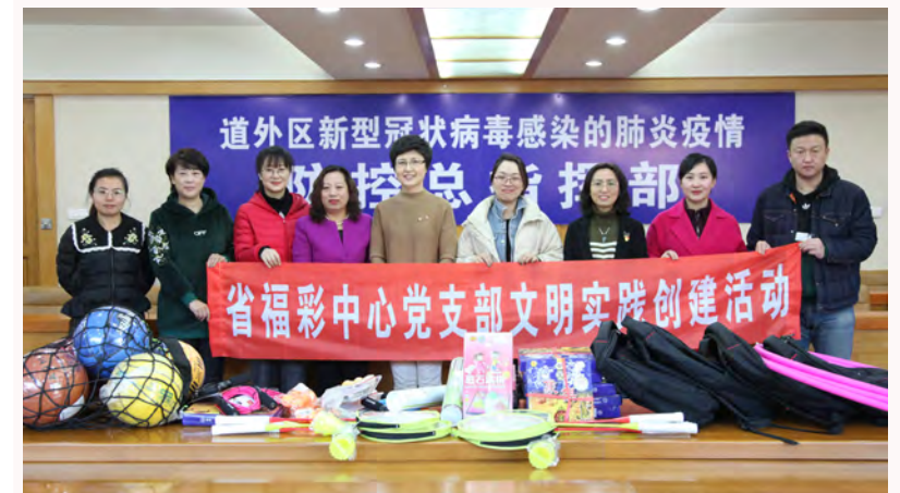
黑龙江省福彩中心与道外区文明实践中心开展文明共建活动 Heilongjiang Welfare Lottery and Daowai District Civilization Practice Center carried out civilized joint construction activities

◎Heilongjiang Welfare Lottery aims to promote the standardized construction of Party branches, and follows the idea of "learning and educating positive thinking, implementing systems to strengthen Party spirit, focusing on backbones to drive change in style, and internal control standards to uphold integrity", adheres to the research, deployment, promotion, and implementation of party building work and lottery business at the same time, providing a strong guarantee for the steady and orderly development of the Welfare Lottery industry.