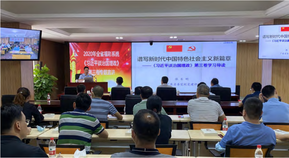
广东省福彩中心开展2020年全省福彩系统《习近平谈治国理政》第三卷专题宣讲活动 Guangdong Welfare Lottery launched a special lecture on “Xi Jinping: The Governance of China II” on the province’s welfare lottery system in 2020

◎ Guangdong Welfare Lottery innovated theoretical learning methods, inviting provincial Party school professors to give lectures on “Xi Jinping: The Governance of China III” to all Party members and leading cadres of the province’s Welfare Lottery system through video conferences. Efforts were made to achieve full coverage of the party’s innovative theories.