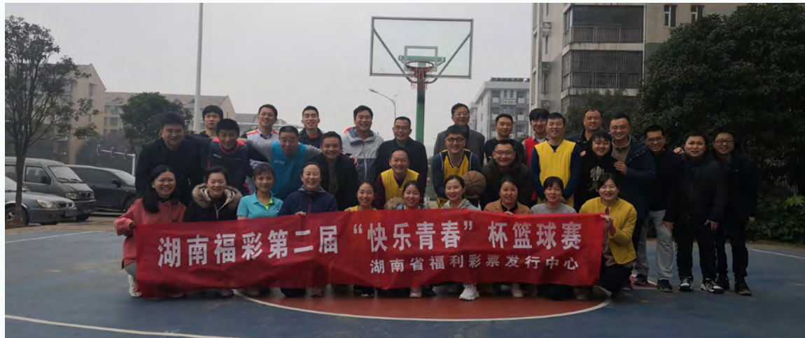
湖南省福彩中心组织开展第二届“快乐青春”杯篮球比赛 Hunan Welfare Lottery organizes and holds the 2 nd Happy Youth Cup basketball competition

© In December 2020, Hunan Welfare Lottery organized the 2 nd “Happy Youth” Cup basketball competition, manifesting young employees’ youth spirit of enterprising and getting united and increasing young employees’ cohesion and combat capacity.