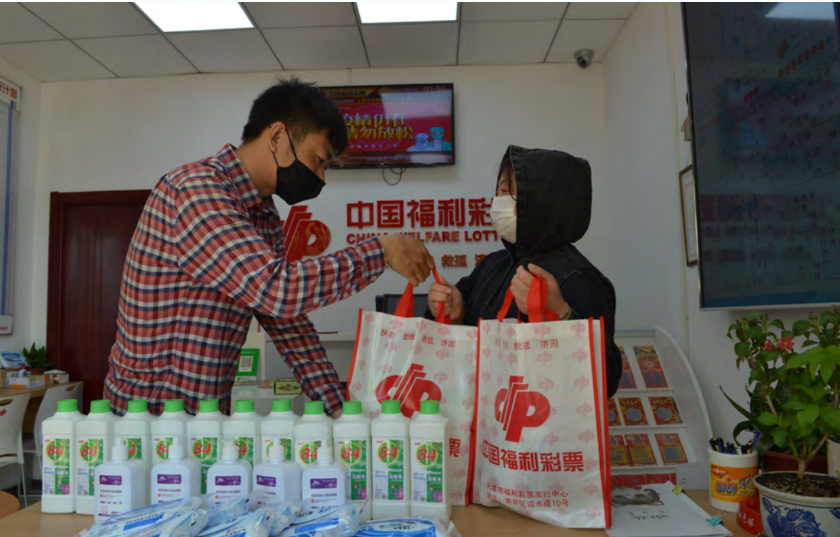
北京市福彩中心为零售商发放防疫物资 Beijing Welfare Lottery distributes epidemic prevention and control materials to retailers

◎ In 2020, Beijing Welfare Lottery spent special fund of RMB 450 thousand yuan on purchasing epidemic prevention and control materials for retailer stores, including face masks, disinfectant, sanitizer, and disposal gloves, etc. It timely distributed these materials timely and correctly.