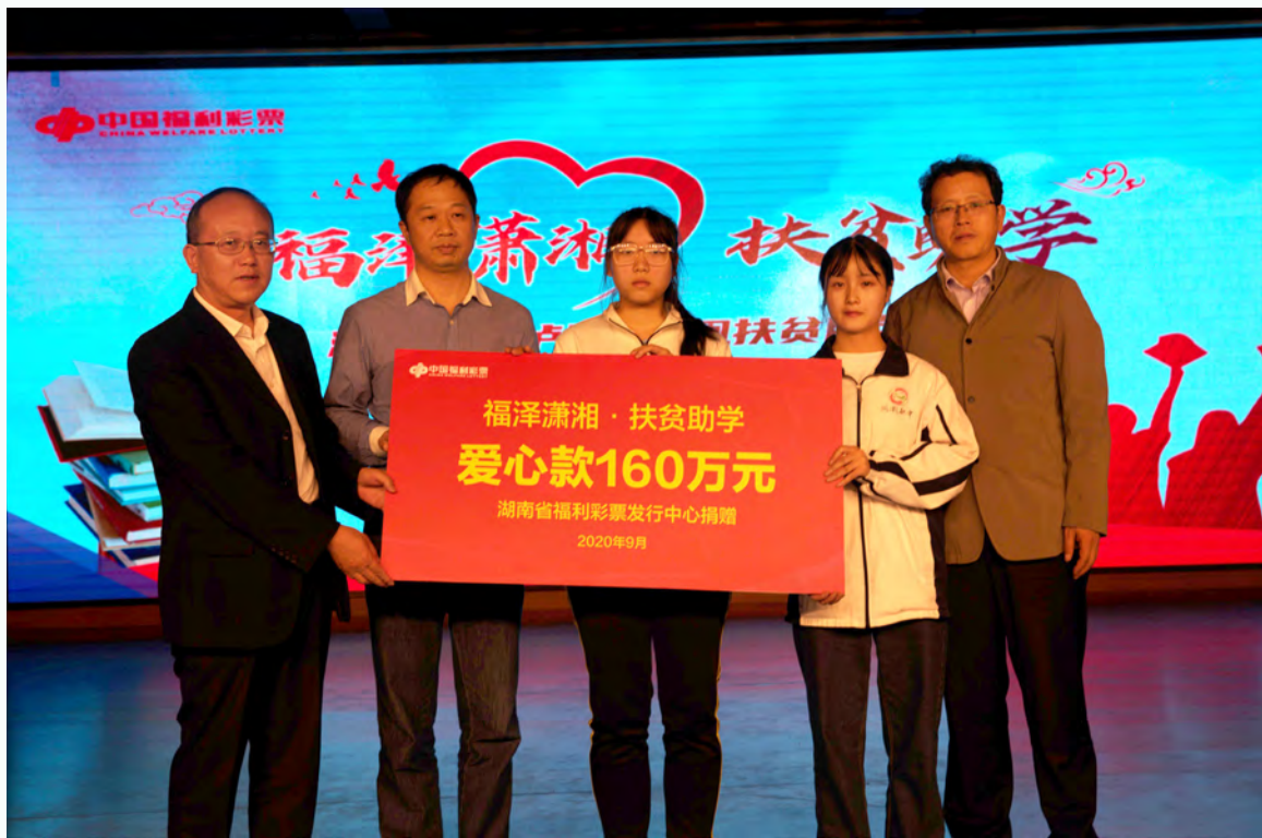
2020年“福泽潇湘·扶贫助学”活动启动仪式 Launching ceremony of the 2020 “Blessing Hunan · Poverty Alleviation and Helping to Learn”

◎ In August 2020, Hunan Welfare Lottery officially launched the 2020 “Blessing Hunan · Poverty Alleviation and Helping to Learn” public welfare activity. Huanan Welfare Lottery arranged special public welfare capital of RMB 1.6 million yuan to help students living in difficulties but with excellence in character and learning. It offered grants of RMB 5,000 yuan to each student, helping them get out from the mountain and poverty, and achieving their ideal and value of life.