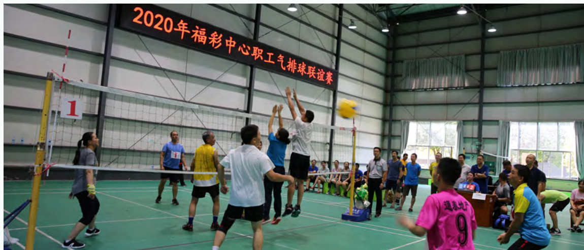
广西省福彩中心组织开展气排球联谊比赛 Guangxi Welfare Lottery holds the balloon volleyball fellowship competition

© In August 2020, Guangxi Welfare Lottery held the 2020 Employees’ Home Balloon Volleyball Fellowship Competition in Nanning Longteng Volleyball Gym to balance employees’ work and life.