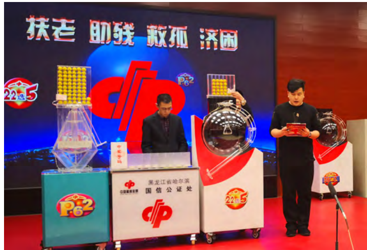
黑龙江省福彩中心在公证人员监督下开展省内玩法开奖 Heilongjiang Welfare Lottery carried out the lottery drawing in the province under the supervision of notary personnel

Heilongjiang Welfare Lottery has formulated a series of system regulations such as lottery drawing management regulations, work procedures, emergency response plans, etc., and strictly implemented process control to ensure that all links are standardized and orderly; regularly organized lottery drawing personnel training to ensure the safe and smooth progress of lottery work.