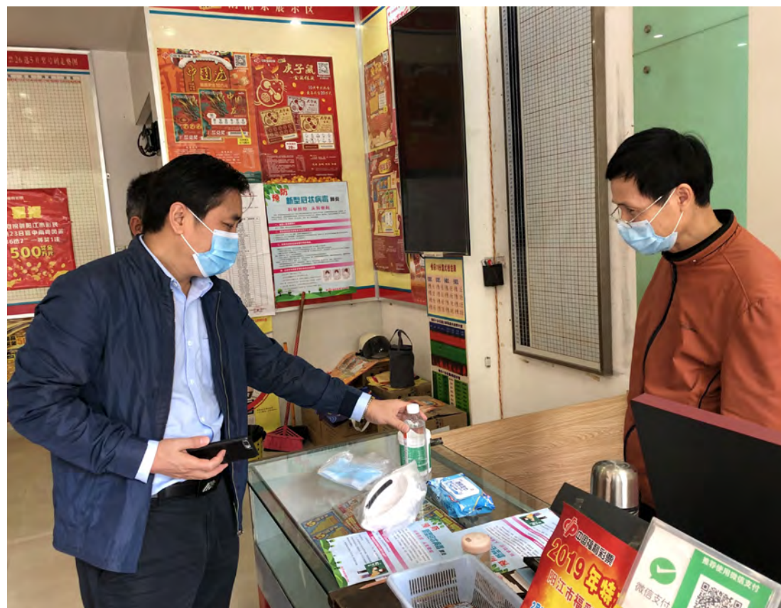
广东省福彩中心督导组检查阳江市零售商 Guangdong Welfare Lottery Supervision Group inspected Yangjiang retailers

In response to the impact of the epidemic on the welfare lottery industry during the market closure, Guangdong Welfare Lottery issued a special subsidy of RMB 18 million yuan for epidemic prevention and control (a subsidy of RMB 2,000 yuan for each Welfare Lottery retail store); procured 9,000 bottles of 84 disinfection tablets, 45,000 packs of disposable 75% alcohol wipes and other epidemic prevention materials and distributed them to welfare lottery retailers in various cities.