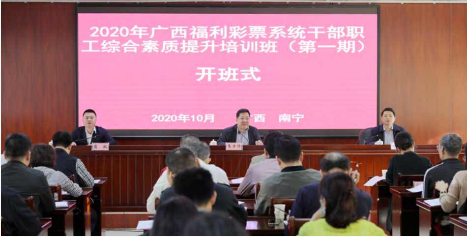
2020年广西福利彩票系统干部职工综合素质提升培训班（第一期）开班式 2020 Guangxi Welfare Lottery System Cadres and Staff Comprehensive Quality Improvement Training Course (Phase 1) Opening Ceremony

◎ In 2020, Guangxi Welfare Lottery started with the development of “learning style Party organization construction” and took the pilot work of action learning application as an opportunity. Various forms of learning and education are adopted, such as concentrated learning, special seminars, Welfare Lottery lectures, Party class education and individual self-study, etc., which firmly consolidates the foundation of ideology and theory.