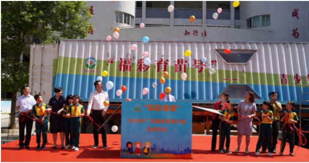
2020年度“广东福彩育苗计划”正式启动 The 2020 “Guangdong Welfare Lottery Seeding Plan” is officially launched

◎ In September 2020, the 2020 “Guangdong Welfare Lottery Seeding Plan” was officially launched. It firstly visited the central primary school in towns concentrating migrant laborers’ children and left-behind children and carried out public teaching activity with featured theme of “Traditional Culture + Technology” activity for students, bringing the whole school brand new course and improving the quality-oriented education level of needy children.