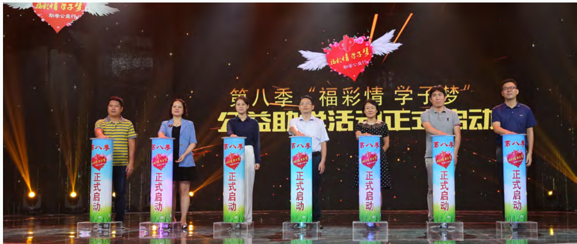
广西省福彩中心举办第八季“福彩情·学子梦”启动仪式 Guangxi Welfare Lottery holds launching ceremony of the 8th “Welfare Lottery Love · Students Dream”

◎ On September 14, 2020, Guangxi Welfare Lottery held the 7th “Welfare Lottery Love · Students Dream” student grant issuance, namely launching ceremony of the 8th “Welfare Lottery Love · Students Dream” in Guangxi Radio and Television Station. As of December 2020, the “Welfare Lottery Love · Students Dream” public welfare activity had used provincial-level welfare lottery public welfare fund of a total of RMB 12.25 million yuan, helping 1, 750 poor students get out of dilemma and enter university.