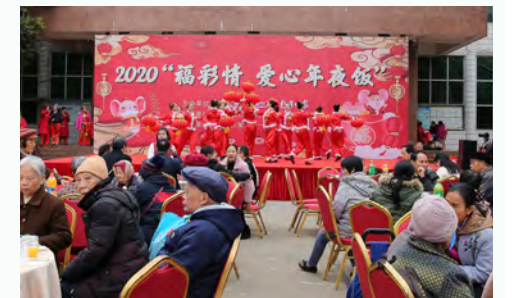
2020年“福彩情·爱心年夜饭”活动 2020 “Welfare Lottery Love · Loving New Year's Eve Dinner” activity

◎ In January 2020, Guangxi Welfare Lottery cooperated with Nanning Evening News to co-conduct the “Welfare Lottery Love·Loving New Year's Eve Dinner” for the fourth times. They visited Hongxing Community and Xinxing Community, Pumiao Town, Yongning District, Nanning and invited 200 people living in difficulties from these two communities to have dinner with love together and donated love goods for use during the Spring Festival to each of them, bringing care and warmth from CWL to those who live in difficulties.