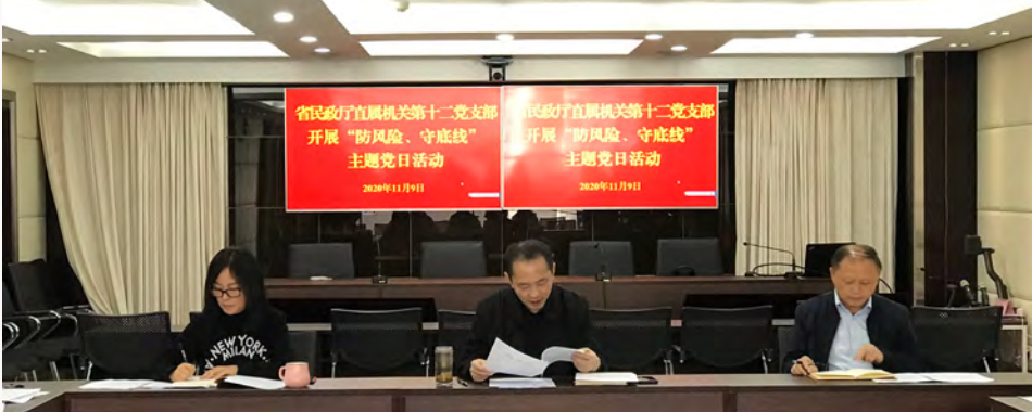
贵州省福彩中心开展“防风险、守底线”主题党日 Guizhou Welfare Lottery launched Party Day activities with the theme of "Preventing Risks and Keeping the Bottom Line"

◎ Guizhou Welfare Lottery organized and carried out thematic seminars and thematic Party Day activities such as “Jointly Fighting the Epidemic, Strengthening Prevention and Control and Stabilizing Sales”, “Preventing Risks, Keeping the Bottom Line”, “Special Party Lessons on Learning and Implementing the Fifth Plenary Session of the 19th Central Committee Spirit”, all totaling 13 times, effectively strengthening the ideological construction of Party members and cadres.