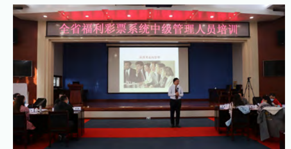
甘肃省福彩中心召开全省福利彩票系统中级管理人员培训 Gansu Welfare Lottery holds training conferences for middle and senior management team of the provincial welfare lottery system

◎ Gansu Welfare Lottery held middle and senior management team and business training conferences to further improve various abilities of senior management team.