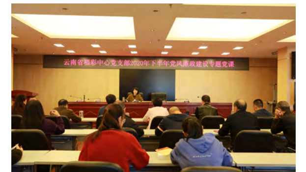
云南省福彩中心组织开展党风廉政建设工作 和集体约谈会 Yunnan Welfare Lottery organized training on Party's work style and upholding integrity construction