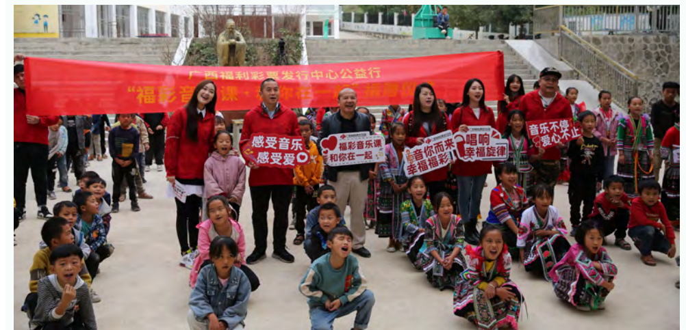
广西省福彩中心组织开展“福彩音乐课·和你在一起”公益活动 Guangxi Welfare Lottery organizes and conducts the public welfare activity named “Welfare Lottery Music Class · Being with You”

◎ In November 2020, Guangxi Welfare Lottery worked with Guangxi Xingbo Film Media Group Co., Ltd. and Nanning Radio and Television Station visited Zhoubang Central Primary School in Bada Town, Xilin County, Baise and held the public welfare activity named “Welfare Lottery Music Class · Being with You”. They donated musical instrument, stationaries, schoolbags, student milk and other materials, bringing students colorful extracurricular activities for their hard study and growing music seeds in their heart.