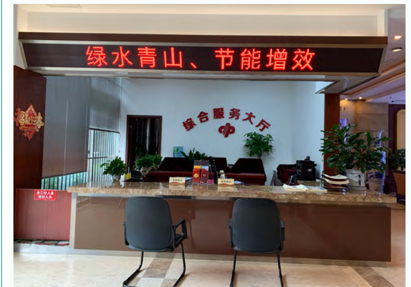
重庆市福彩中心开展绿色宣传周活动 Chongqing Welfare Lottery conducts the energy saving publicity week activity

◎Chongqing Welfare Lottery gave full play to its demonstration and leading role in "Protecting Lucid Waters and Lush Mountains, Building A Beautiful China", conducted the energy saving publicity week activity, guided cadres and employees to develop green and low-carbon lifestyle and working mode and strengthened environmental protection awareness of cadres and employees.