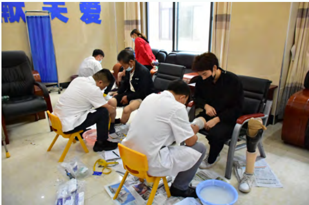
湖南省福彩中心开展助残公益活动 Hunan Welfare Lottery conducts supporting the “Assisting the Disabled” project

◎ Hunan provincial-level public welfare funds have been supporting the “Assisting the Disabled” project for five consecutive years, totally investing RMB 95 million yuan of special fund, providing more than 120, 000 sets of rehabilitation assistive devices, fitting artificial limbs, orthotics and other assistive devices for more than 10, 000 personnel and actually improving the disabled' life quality. In September 2020, Hunan Welfare Lottery worked together with Hunan Rehabilitation Assistive Technical Guidance Center to help 91 disabled people who met requirements and conditions of receiving assistance of the project.