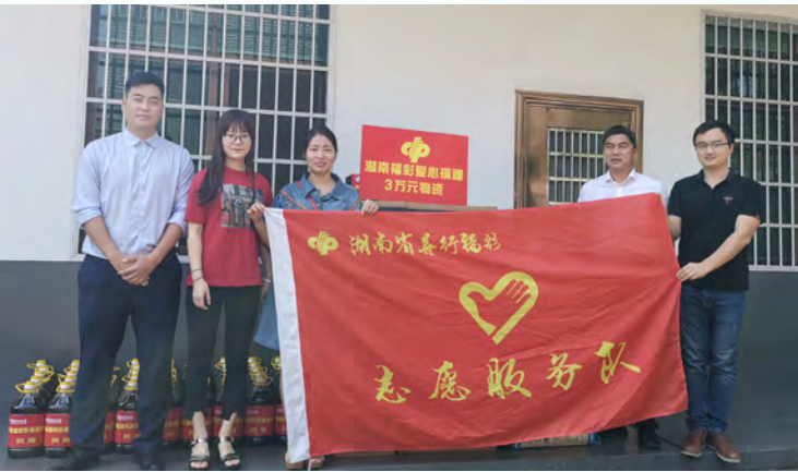
湖南省福彩中心开展“福泽潇湘·金秋惠老”公益活动 Hunan Welfare Lottery conducted the public welfare activity “Blessing Hunan · Caring for the Elderly in Autumn”

◎ Hunan Welfare Lottery totally invest- ed public welfare fund of RMB 800,000 yuan for three consecutive years on conducting the public welfare activity “Blessing Hunan · Caring for the Elderly in Autumn”, helping and visiting disabled and half-disabled elders in the elderly home and communities, donating spe- cial funds to improve their living con- ditions and facilities and organizing charity volunteers to give them mental comforts.