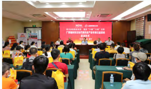
广西福彩零售店代销扶贫产品专项公益活动启动仪式 Launching ceremony of selling poverty alleviation products in CWL retailer stores in Guangxi

◎ Implementing the spirit of the two sessions and the decisions and arrangements of Guangxi's further conducting consumption-related poverty alleviation and helping poverty-stricken areas get rid of poverty, Guangxi Welfare Lottery held the special public welfare activity of poverty alleviation products in welfare lottery retailer store, which provided a publicizing and sales platform for these products with attractive price and quality and contributed its power to construct a well-off society in an all-round way and fulfill the task of ensuring stability on the six fronts and security in the six areas.