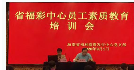
海南省福彩中心员工素质教育培训会 Employee quality-oriented education training conference held by Hainan Welfare Lottery

◎ In September 2020, Hainan Welfare Lottery organized and held employee quality-oriented education training conference to improve all employees' comprehensive quality and ability.