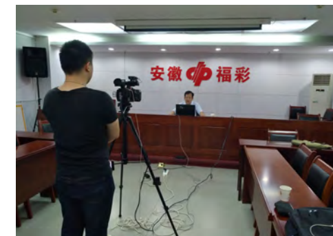
安徽省福彩中心录制线上课程 Online Course Recorded by Anhui Welfare Lottery

Anhui Welfare Lottery made full use of the convenience and popularity of mobile phones to build a mobile WeChat education platform-"Anhui Welfare Lottery Training" WeChat mini program for managers and retailers of welfare lottery institutions at all levels in the province. The platform has launched courses on the prevention and safety of COVID-19 coronavirus, betting machine maintenance, lottery award specifications, lottery laws and regulations, etc., which enhances the professional ability of welfare lottery practitioners and guarantees the stable and orderly development of the Welfare Lottery market.