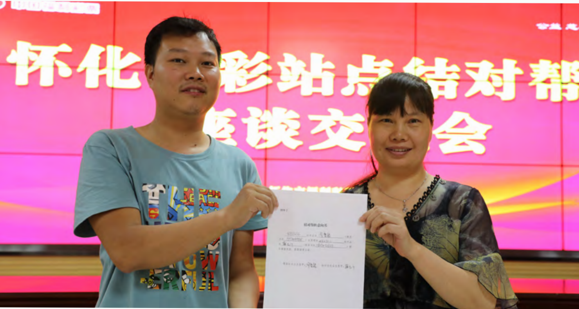
湖南省福彩中心开展“千站结对帮扶”活动 Hunan Welfare Lottery conducts the “Thousand Stations Pairing Training and Assistance” activity

◎ Hunan Welfare Lottery launched special activity of “Thousand Stations Pairing Training and Assistance”, carefully selecting 500 outstanding retailers from the whole province to pair with 500 retailers with low sales volume to help them. In this way, the latter’s sales increased RMB 52.88 million yuan with year-on-year growth of 40.03%, overfulfilling paired retailers’ sales task of RMB 20 million yuan. It held 191 times of business training of “Thousand Stations Pairing Training and Assistance” with 4, 842 personnel attendance.