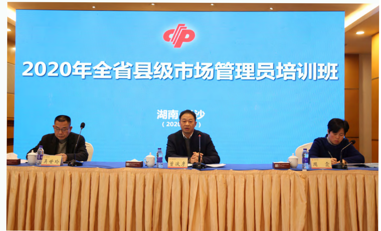
湖南省福彩中心组织开展全省县级专管员培训班 Hunan Welfare Lottery organizes and holds county-level manager training classes

All provincial branches emphasize ability building of managers and improves their comprehensive professional abilities through irregular intensive training.