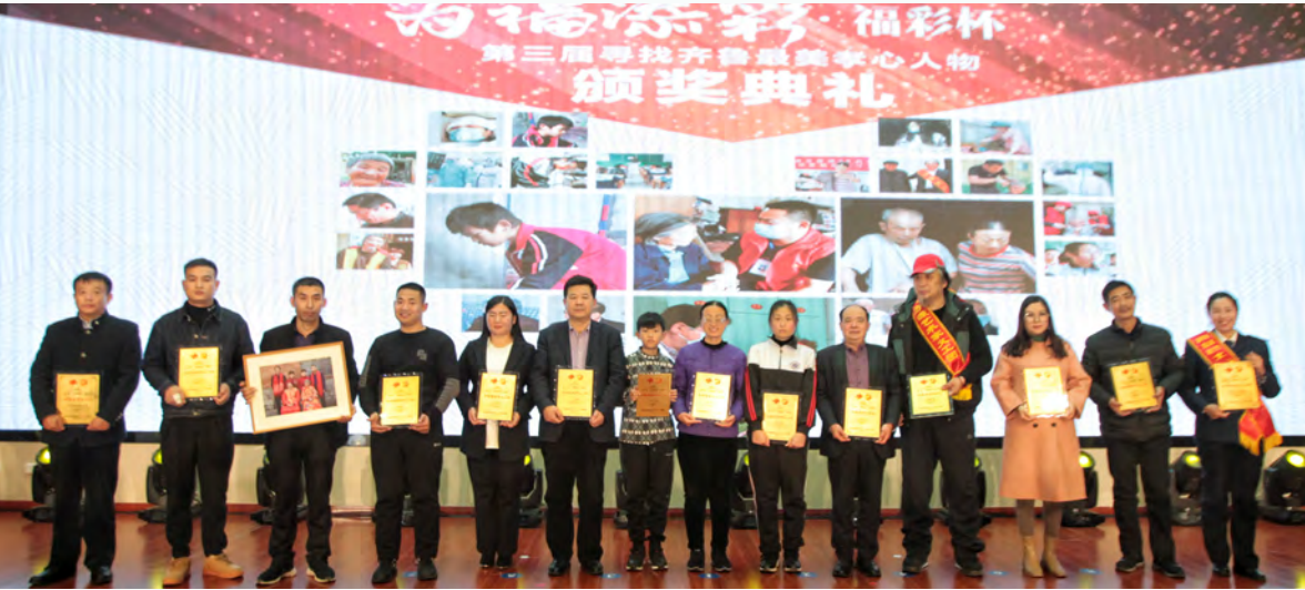
第三届寻找齐鲁最美孝心人物评选活动颁奖典礼 Award ceremony of the 3rd Looking for the Most Beautiful Filial Piety Persons in Shandong

◎ Shandong Welfare Lottery and Qilu Evening News app launched a selection activity named the 3rd “Adding Luster to Happiness · Welfare Lottery Cup” Looking for the Most Beautiful Filial Piety Persons in Shandong. With recommendation of organizations, the society and individuals and selection in 16 city stations, 10 most beautiful filial piety persons in Shandong and five individual award winners were selected after public vote and expert review.