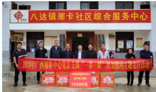
广西省福彩中心赴八达县那卡社区开展扶贫慰问活动 Guangxi Welfare Lottery visits Naka Village, Xilin County to conduct the party day activity

◎ Guangxi Welfare Lottery visited Naka Village, Xilin County to conduct the party day activity themed on “Helping A Poverty-Stricken Household & Contacting A Demonstration Household Becoming Rich”. It totally invested over RMB 870,000 yuan to Xilin County for poverty-stricken family children's education, rebuilding dilapidated houses, drinking water project, road construction and development of collective industrial projects of pig raising. Meanwhile, Guangxi Welfare Lottery also participated in consumption-related poverty alleviation. It purchased agricultural products produced in poverty-stricken areas and helped Xilin County get rid of poverty and striving for a well-off life with practical actions.