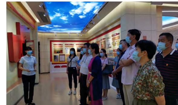
湖南省福彩中心在长沙廉政教育基地开展廉洁建设教育活动 Hunan Welfare Lottery carried out upholding integrity education activities in Changsha Upholding Integrity Construction Education Base

CWLIMC strictly implements the eight-point decision on improving Party and government conduct, carefully organizes self-inspection, advances the rectification of formalism and bureaucracy, strengthens daily monitoring and important time node management, and resolutely prevents the resilience of "Four Problematic Styles". CWLIMC continues to conduct discipline learning and education, pushes forward the education activities of popularizing law and discipline knowledge, and reinforces the discipline consciousness of party cadres. Moreover, it also strengthens the supervision and management over party cadres, establishes and maintains the integrity files of all party cadres within CWL. By promoting the use of "Four Formats" of supervision and discipline, CWLIMC further consolidates the clean political ecology within CWL.