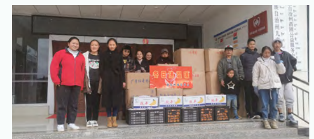
云南省福彩中心组织开展“冬日送温暖”活动 Yunnan Welfare Lottery organizes and conducts the activity themed on “Sending Warmth in Winter”

◎ In January 2020, Yunan Welfare Lottery conducted the activity themed on “Sending Warmth in Winter” in Diqing Children Welfare Home. It donated rice, tissue and other living materials worthing RMB 30,000 yuan and made children feel they were loved and cared by the society.