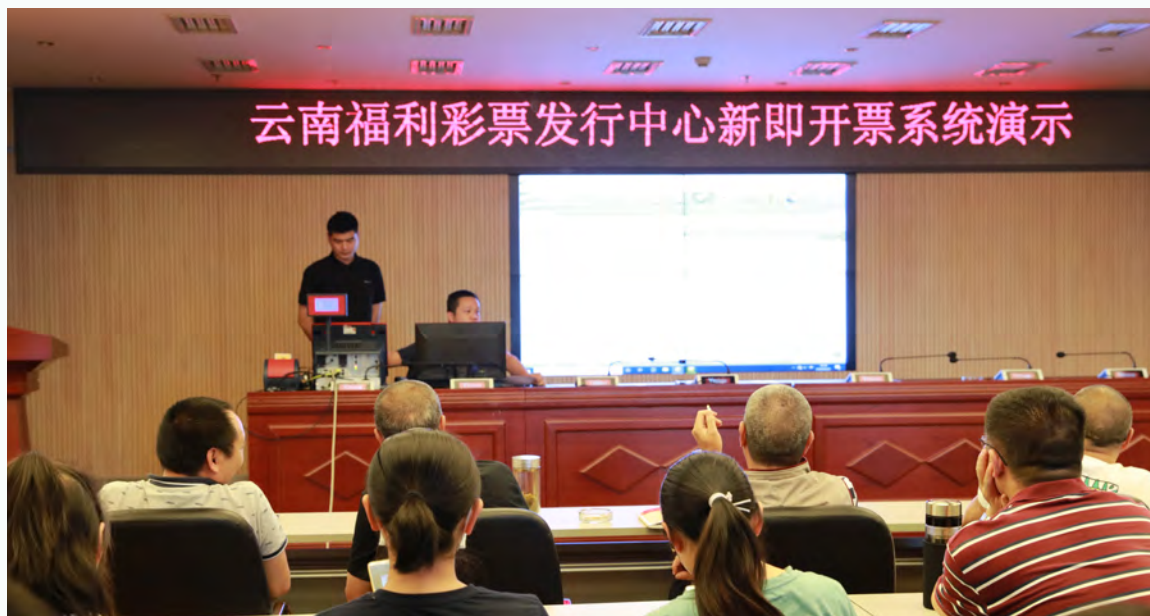
云南省福彩中心开展新即开票系统培训 Yunnan Welfare Lottery holds new instant game system training

◎ Yunnan Welfare Lottery organized and put the 2020 new sales and payment system of instant game into use and held new instant game system training to provide players higher quality service.