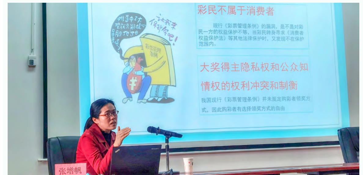
北京市福彩中心邀请专家开展责任彩票培训 Beijing Welfare Lottery invites expert to conduct responsible gaming training

◎ In October 2020, Beijing Welfare Lottery invited a professor from Beijing College of Social Administration to give trainings themed on responsible gaming,, improving party members' and cadres' understandings of responsible gaming, promoting the integration of responsible gaming concept and business and strengthening the construction of responsible gaming.