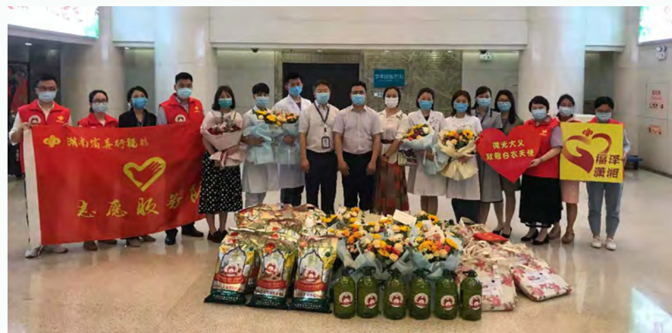
湖南省福彩中心慰问抗疫一线青年医务人员 Hunan Welfare Lottery sends regards to young doctors and nurses who are fighting COVID-19 epidemic in the frontline

◎ Hunan Welfare Lottery worked with the Civilization Office of provincial organs and Hunan Caixin Public Welfare Foundation to conduct the volunteer service activity named “Little Strength Making Righteousness · Saluting to Doctors and Nurses”. They visited and sent regards to doctors and nurses who supported Hubei as well as their relatives in the form of volunteer services to encourage those who were fighting COVID-19 epidemic in the frontline.