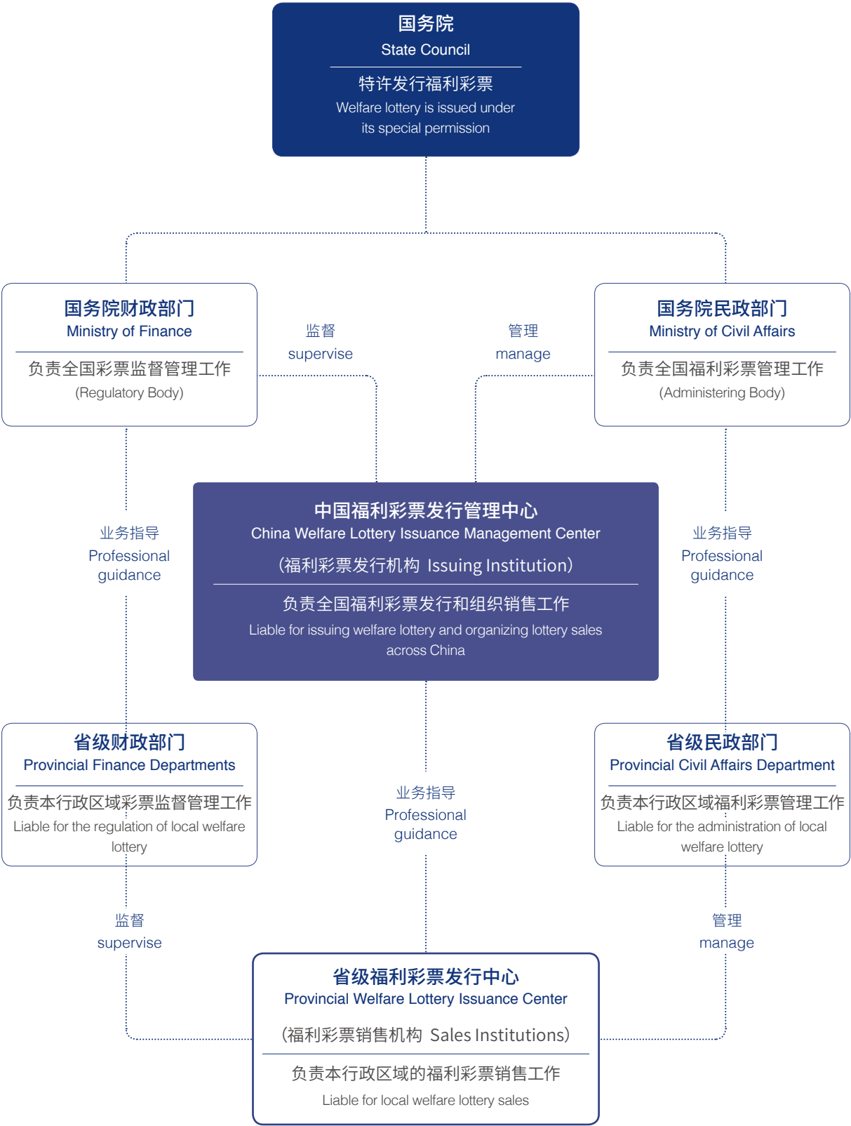
中国福利彩票管理体制 CWL Administration Mechanism

Under the uniform organization of CWLIMC, provincial level welfare lottery sales institutions are responsible for local welfare lottery sales.