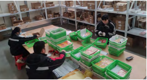
江西省福彩即开票仓储直配物流 Jiangxi Welfare Lottery Instant Lottery Inventory Direct Distribution Logistics

◎ Jiangxi Welfare Lottery has established a logistics network system for retail stores instant lottery direct distribution across the province through the introduction of “SF Express”, which has a strong influence in domestic express delivery, improved the difficulty of retailer’s capital turnover, slow turnover of instant lottery inventory, and the lack of display of genuine lottery. As of the end of December 2020, it has provided instant lottery direct distribution services to more than 5,000 retail stores in the province, which has been unanimously recognized and widely praised.