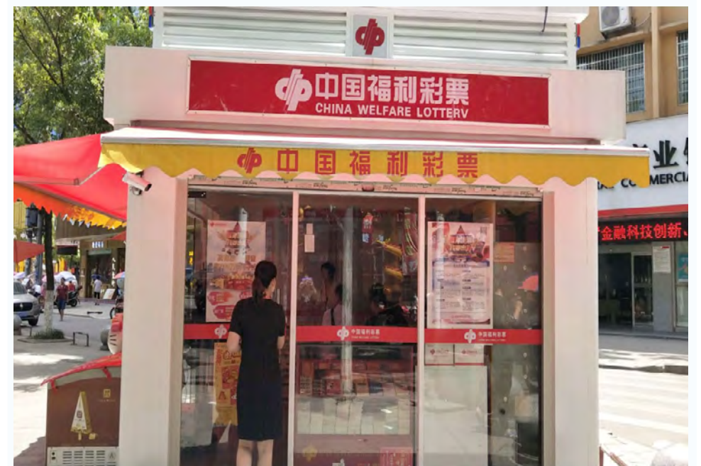
湖南省福彩销售亭建设 Construction of Hunan Welfare Lottery Sales Kiosk

◎Hunan Welfare Lottery provided RMB 1.855 million yuan of special funds for the construction of Welfare Lottery sales kiosks in various districts and counties; deepened the integrated development of "Welfare Lottery +", actively explored cross-industry cooperation with Agricultural Bank of China, Bank of China, and China Construction Bank to expand the group of new Players; exploited the rural market and carried out the deployment of blank towns and villages.